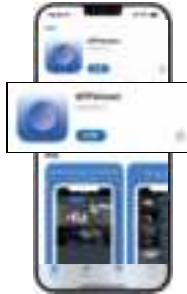
Download and install APP APPshowx