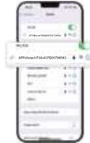
Select wifi "APPshow-..." and connect (WIFI password: 12345678 )