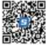
Android/iOS Scan and Download