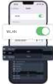
Turn on WIFI on your phone and device