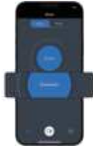
Turn on APP APPshowx